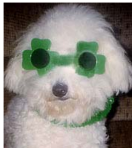
(Happy St. Pats Day!)

A minister was completing a Temperance sermon. With great emphasis he said, "If I had all the beer in the world, I'd take it and pour it into the river. "