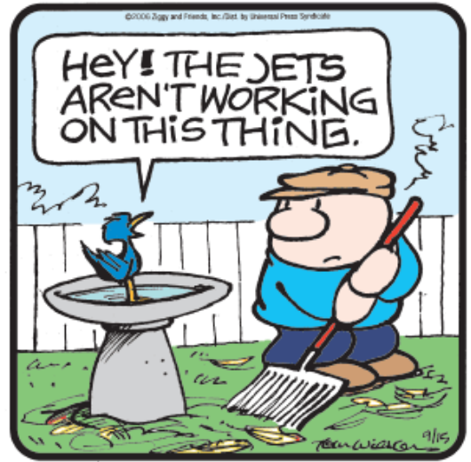
This is how the birds treat me after migration.

"Never give the devil a ride. He will always want to drive."