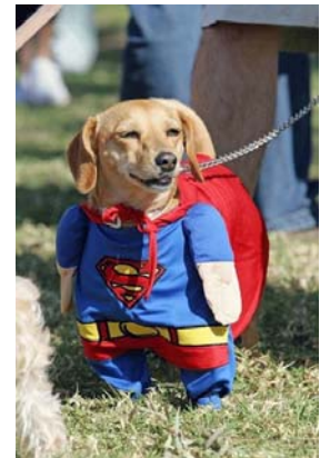
We must get ready to look our best for Easter.