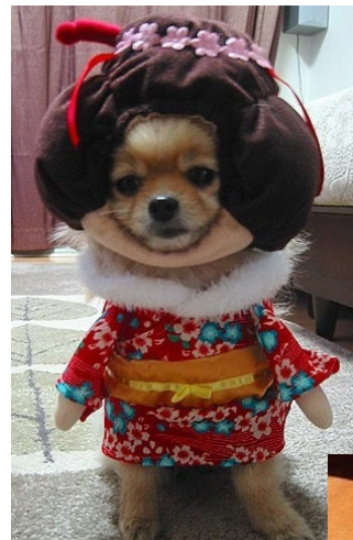
Or we could just sleep in!